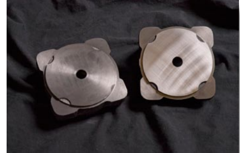
Unfinished surface and after our modified precision rotary surface grinding on a cast iron part.

Columbia Grinding applies new technologies to an old machine and process. Our modified Blanchard style grinder can now hold \pm .0002 inches across a 42 inch rotary table. This application of newer styles of abrasives gives way to many grinding possibilities. A second machine was added because of increased demand.